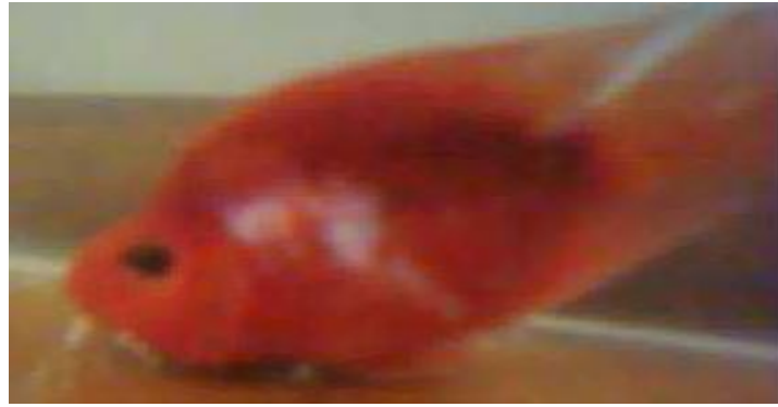
Figure 1. Skin lesions caused by M. morganii in blood parrot cichlid.