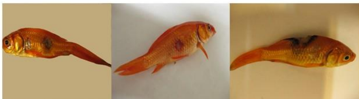
Figure 3. Experimental infection by M. morganii in goldfish showing skin lesions on the lateral and dorsal areas of affected fish.

Affected goldfish demonstrated skin lesions on different body parts including lateral side, pectoral area and dorsal site (saddle back lesions) (Fig. 3). Mortality was initiated 6 days post challenge. Internally affected fish developed hyperemia in their internal organs such as liver and kidney. The mortality rates in stressed and non-stressed fish reached in 60 % (18 fish) and 36.66 % (11 fish), respectively. Also, no mortality was seen in control fish (challenged with sterile PBS). M. morganii was re-isolated from the kidney, spleen, liver and muscle of affected goldfish and confirmed by phenotypic and PCR assays.