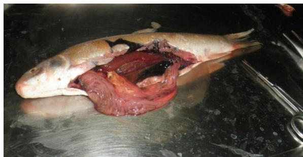
Fig. 3 Dissection of examined fish, Capoeta barroisi

The methods and techniques used for collection, relaxation, fixation, staining and mounting of helminthes are basically those described by Hanek and Fernando (1972) and Roberts (2001).