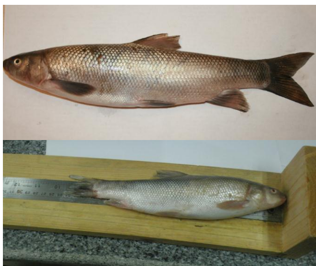
Figure 2 Capoeta barroisi

identification key. The standard length and weight of each fish was measured to the nearest millimeter and milligram, the sex was determined internally (Fig. 2).