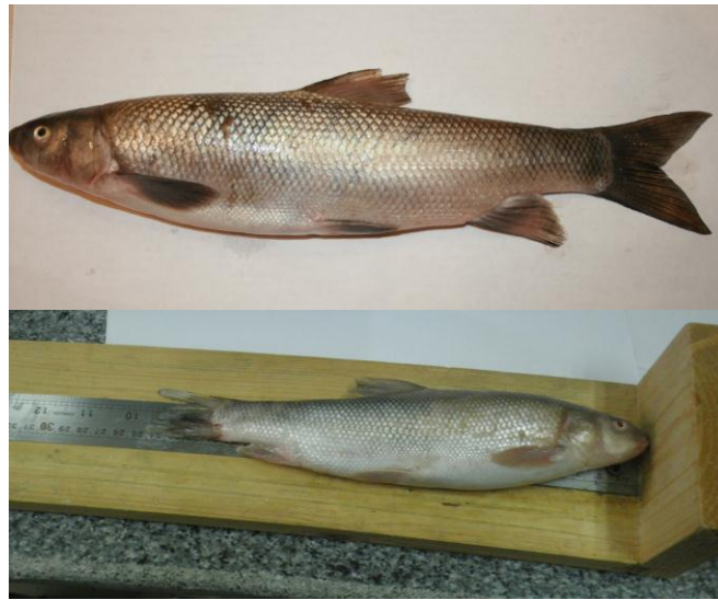
Figure 2 Capoeta barroisi

identification key. The standard length and weight of each fish was measured to the nearest millimeter and milligram, the sex was determined internally (Fig. 2).