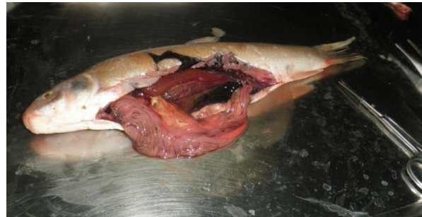
Fig. 3 Dissection of examined fish, Capoeta barroisi

The methods and techniques used for collection, relaxation, fixation, staining and mounting of helminthes are basically those described by Hanek and Fernando (1972) and Roberts (2001).