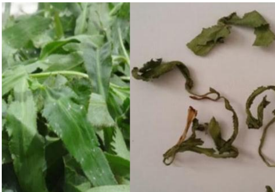
Fig 2 Falcario vulgaris , fresh leaves (left), dried leaves (right)

http://www.discoverlife.org/mp/20p?see=L_MWS108791&res=640