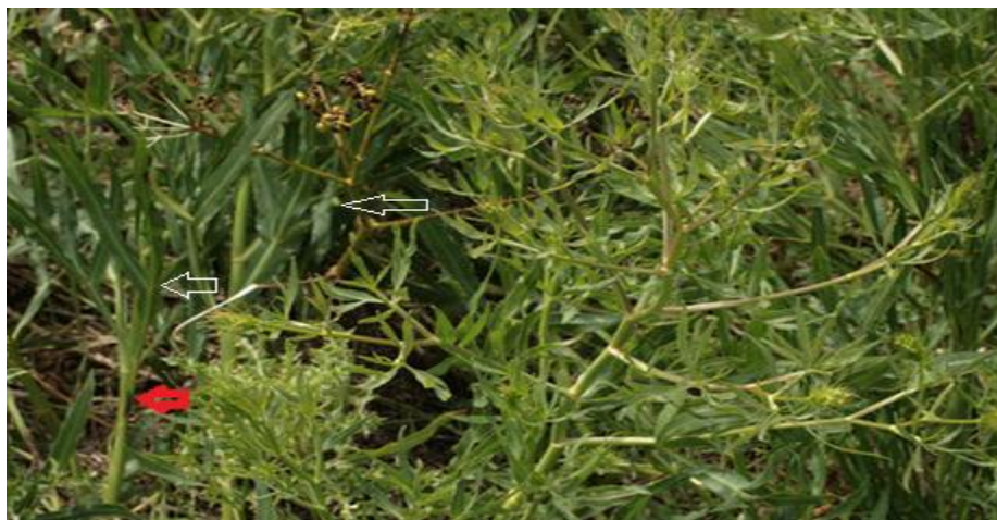
Fig 1 Falcario vulgaris , leaf (White arrow), stem (Red arrow) and size