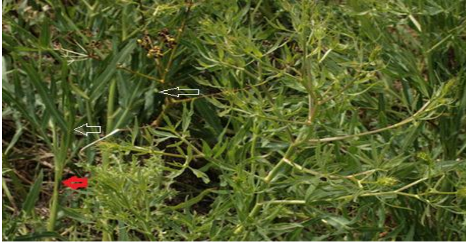
Fig 1 Falcario vulgaris , leaf (White arrow), stem (Red arrow) and size