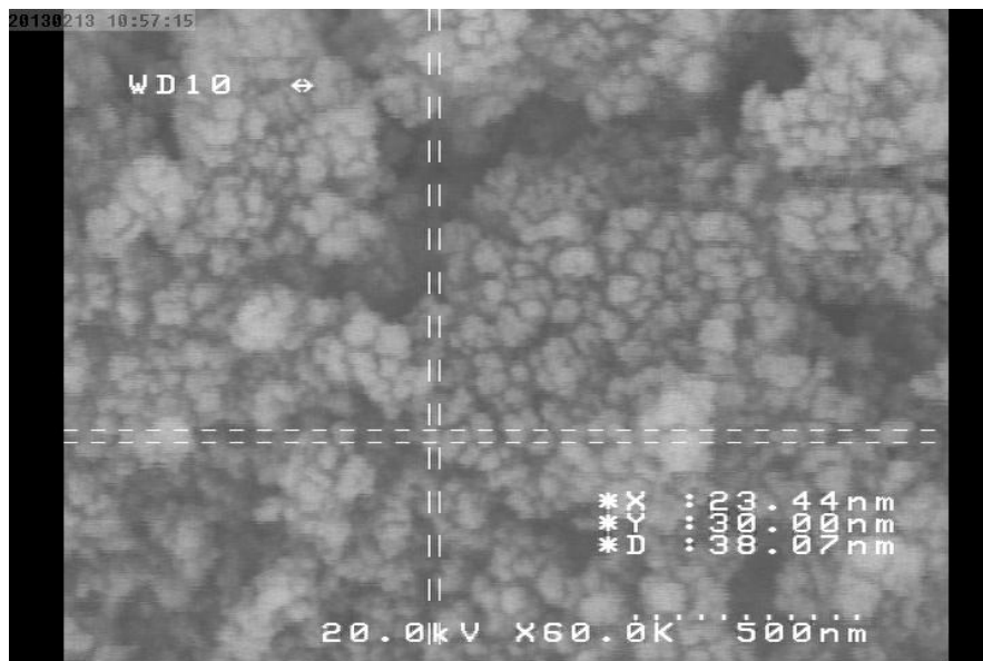
Fig 1: Regulation of Nano particles (Ag) by SEM .

In the third case, this is of high importance for marketing and even attracting the customers in the shops pallets which is a topic in the field of food products marketing and not the concern of this article (Tierney 2017).